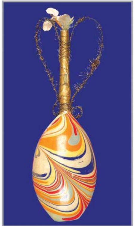
11005 END OF DAY VASE WW 7"