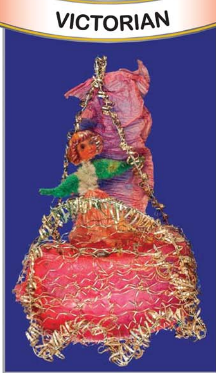
11001 BABY CRADLE WITH BABY WW 5"