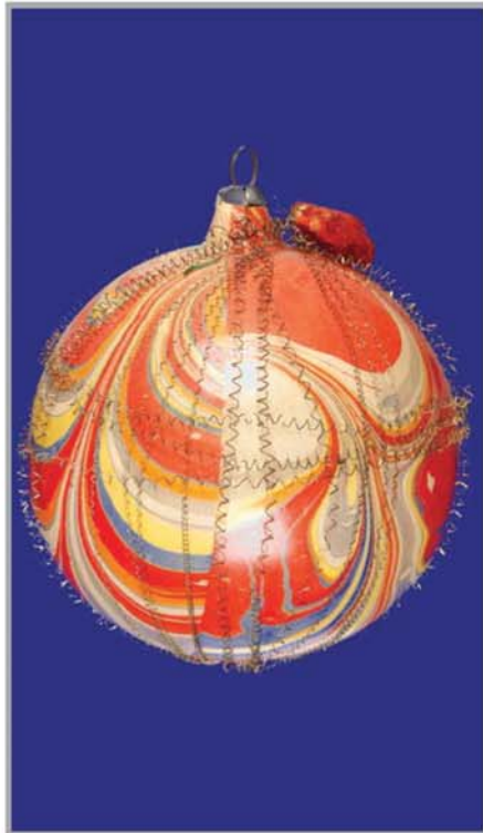
11004 END OF DAY W/WIRE WRAP