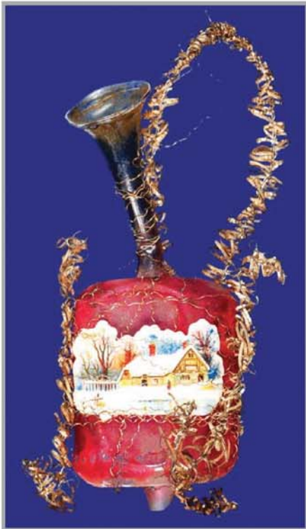
11003 GRAMAPHONE WW 4.5"